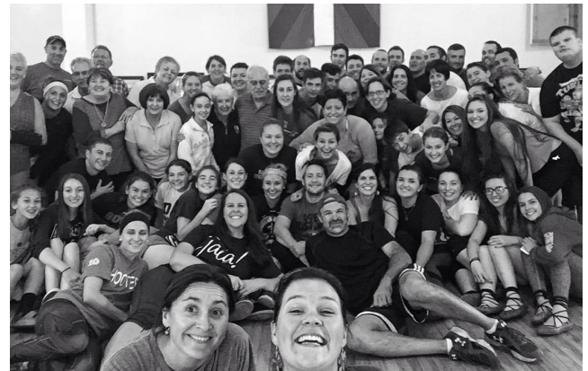
Our first Oinkari Alumni Practice, October 2015

Oinkari Alumni Practice is back! You told us that fall is the best time to be in the hall, and we listened! We invite all alumni of Oinkari to join us at 3 PM on October 22 for a little dantza. Our last few attempts at alumni outreach have not been well-attended, so we want to challenge you to make this practice the best one yet! Get that old phone tree going and let's see how many feet we can get on the floor! Whether you're ready to jump right back into the one spot or you're going to be a stage sitter, we're looking forward to seeing you there.