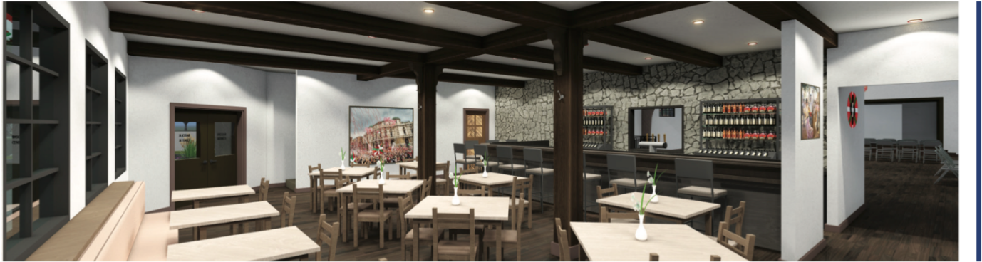
Renderings are subject to change as project progresses.