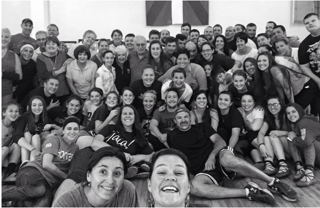
Our first Oinkari Alumni Practice, October 2015

Oinkari Alumni Practice is back! You told us that fall is the best time to be in the hall, and we listened! We invite all alumni of Oinkari to join us at 3 PM on October 22 for a little dantza. Our last few attempts at alumni outreach have not been well-attended, so we want to challenge you to make this practice the best one yet! Get that old phone tree going and let's see how many feet we can get on the floor! Whether you're ready to jump right back into the one spot or you're going to be a stage sitter, we're looking forward to seeing you there.