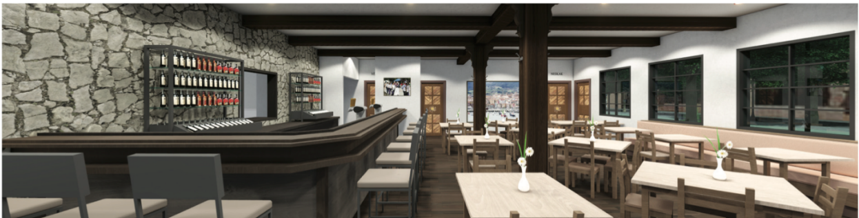
Renderings are subject to change as project progresses.