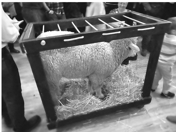
Lamb auction, Shepherders Ball 2019

The Farmer's Dance followed four weeks later. This event was held Saturday, December 10, at the Miramar Ballroom. On the expense sheet was this item: 20 cents for a ribbon for the lamb. (Maybe there was a lamb auction?) This time the band was paid $45. The net profit was $495.