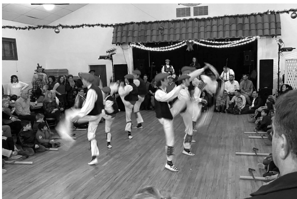
Oinkari dancers, Shepherders Ball 2019

At some point from 1950 and for many years to come, the number of dances was reduced. Certainly, there were no longer two dances in December. The Farmer's Dance and the Annual Christmas Dance eventually merged into the Shepherders Ball. During the 50s, this dance was most often held between Christmas Day and New Year's Day.