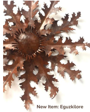
New Item: Eguzkilorre

Join the Biotzetik Basque Choir on Wednesday, December 6 at the Idaho State Capitol building. Biotzetik will present a program of Basque Christmas music beginning at 6:00 PM on the 2nd floor Rotunda. The program will conclude with an audience sing-along of traditional carols in Basque and English.